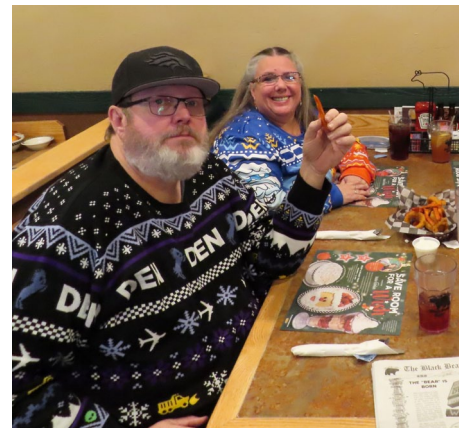
The Jackson Four, below left