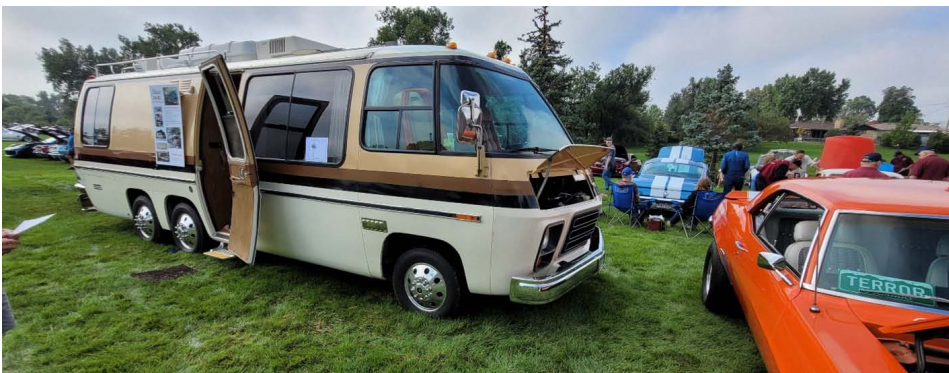
Another GM classic from the 2024 Holy Rollers show, this mid-1970s 6-wheel FWD GMC Motor Coach would be a perfect accessory for towing your Corvair to shows as you see the USA with your Chevrolet!