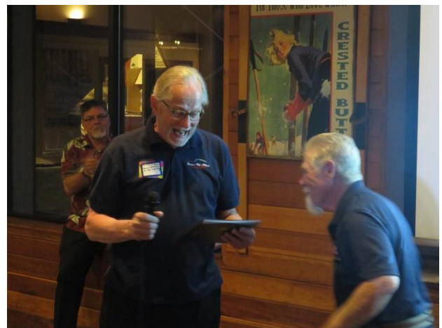
Dale Nielsen Boydston Award