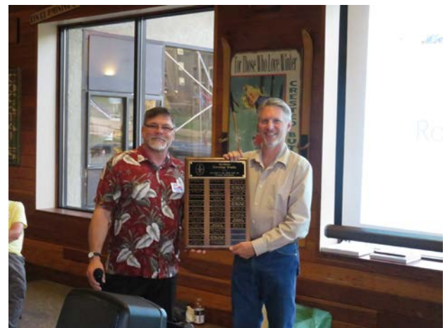
RMC won the award for the most attendees at the Tri-State Meet in Crested Butte.