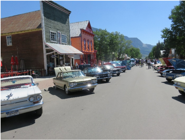
The view down Elk Avenue during the car show. It was a beautiful site to see.