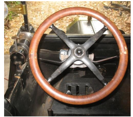
Ford Model T Steering Wheel

From the teens and twenties, the wheels were massive in thickness. Was this perhaps that the wheels were made from laminated wood and strength dictated the thickness? Seems logical to me. But when Ford made the wheels for the Model A (picture below) out of plastic, the wheels were thicker than the wheels of the Corvair era. If I recall correctly, the steering wheel on my Dad's '48 Chevy was thicker than on my '64. Yes, what gives?