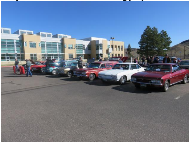
Late model (mostly) row