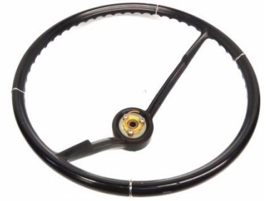
Corvair Steering Wheel

Among the many things I don't understand is why the steering wheels on the Corvair (and other steering wheels of that vintage) are so thin. Look at the photo below. Thin! I can understand the need for the larger diameter (to make it easier to turn the wheel without power steering) but what about the thickness? At car shows, folks notice the steering wheel and often ask about the thickness. "Gee, the steering wheel on my _____ SUV is much thicker". Were hands smaller then than now? What gives?