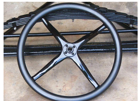
Ford Model A Steering Wheel

In pre-power steering years, one might assume that a thicker wheel would provide a better grip. Such a grip would be needed to apply greater turning force. This might explain the thickness of the early, early, steering wheels and the generally greater wheel diameter. But the Corvair had no power steering. If grip was really an issue, why not thicker? Cost? Perhaps.