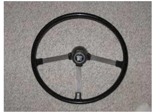
TR-4 steering wheel (thin)

Today, we have air bags, power steering, collapsible steering columns, collision warnings and even automatic braking, side scanning lane change detectors, dashboard distracting displays, and texting drivers who are drunk and/or on drugs. Perhaps that is the answer. For today's vehicles, given the above, we simply need to "get a (better) grip".