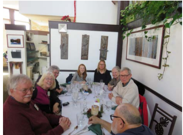
A couple of shots from brunch.