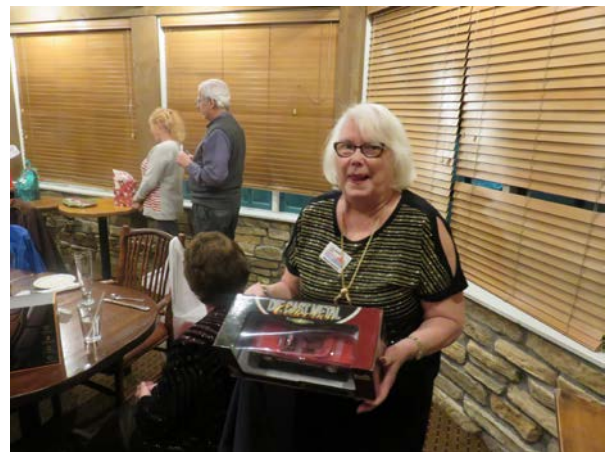
A couple of shots from the Christmas party.